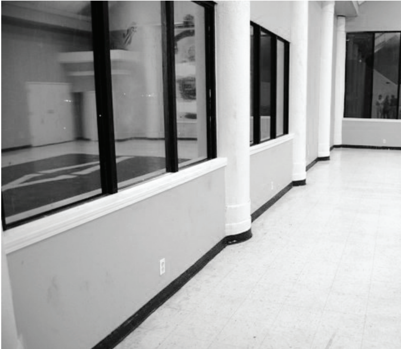
Work in the large meeting room in phase one included taking out all the broken vent windows and walling in that section to the main windows. The Coat of Arms remains to be re-painted, and we still have a troublesome leak in the room.