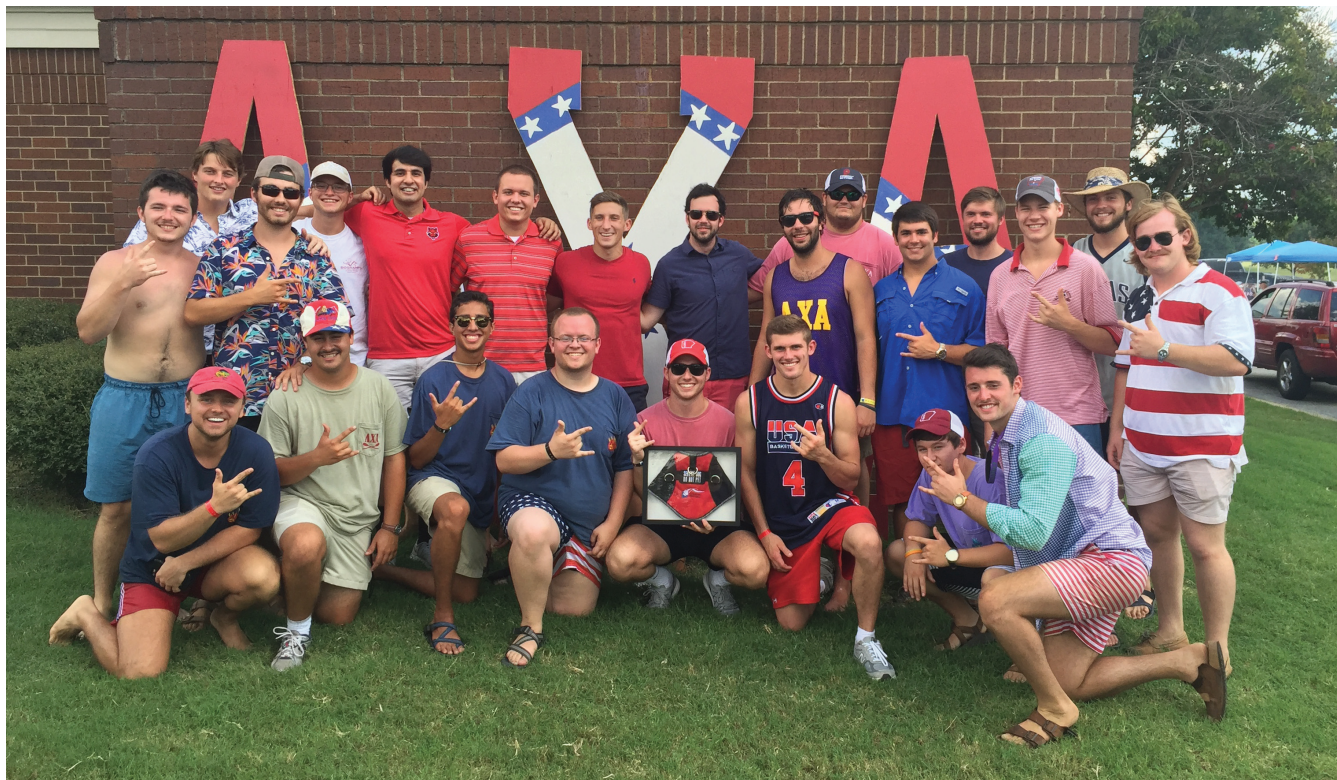
A group of actives and alumni gather to celebrate Iota-Theta's first Red, White and Blue BBQ event (details on page 6).